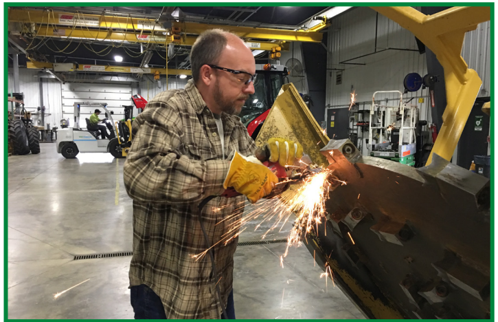
Sharpening forestry teeth