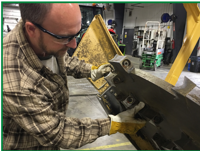
Inspect forestry teeth daily