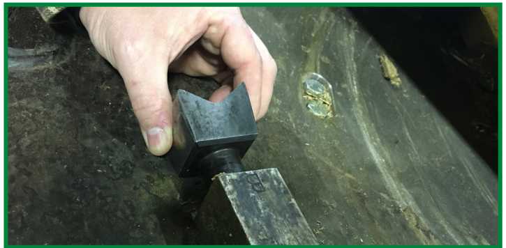
Rotate forestry tooth in the holder