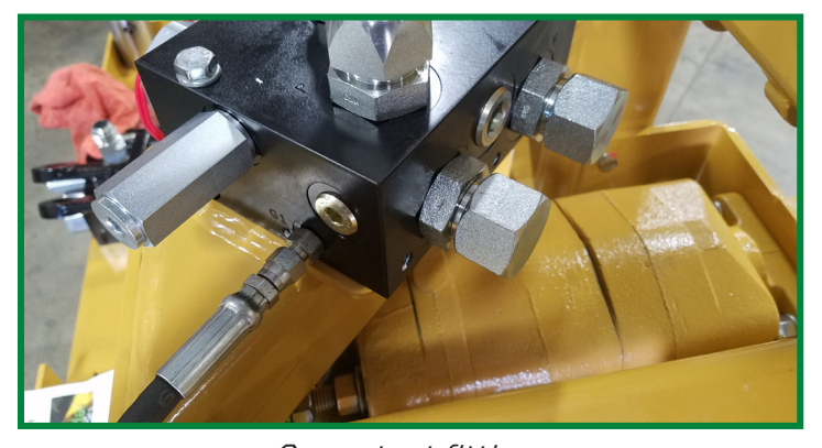
Cap output fittings