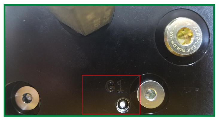
G1 port plug