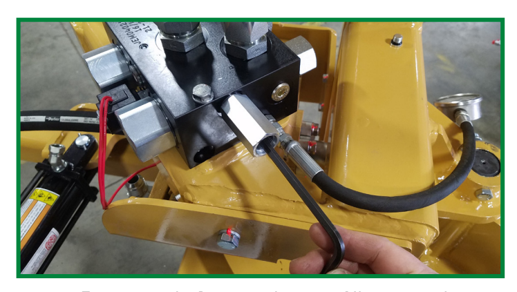
Remove relief cap and insert Allen wrench

FOR MORE INFORMATION, CALL OUR WARRANTY/SERVICE TEAM AT (605) 977-3300 OR TOLL FREE AT (888) 960-0364 OR EMAIL WARRANTY@DIAMONDMOWERS.COM