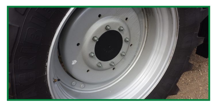
Example of factory setting